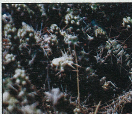
Prickly Pear Cactus

What? Cactus plants at the Northwest Angle and Islands? One of the greatest botanical wonders of our area is the presence of the prickly pear cactus plants ( Opuntia fragilis ) – found in micro-habitats along various shorelines on the lake, including Flag Island. Just how these plants came to inhabit the shores of Lake of the Woods is open to conjecture. It is possible some seeds were carried in by birds, or parts of the plant floated to this area in prehistoric times.