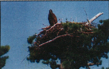
Fledgling Bald Eagle

Our resorts offer you a scenic, wilderness setting, exceptional accommodations, year around activities, privacy, relaxation, fishing on sheltered shorelines of two countries – all on the pristine, world-class fishery of Lake of the Woods. Explore your options and call today!